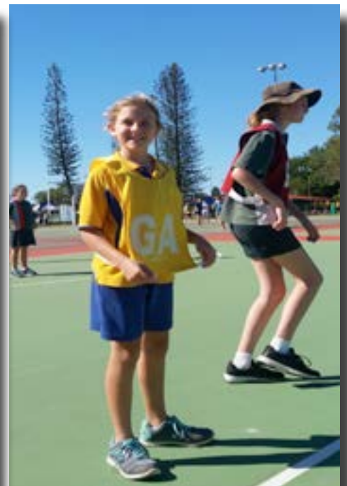
Students from Primary and Secondary enjoyed the Zone carnival in Ballina