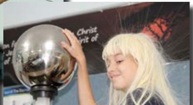
Year 7 Science Experiments