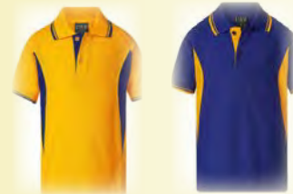
New style Primary polos