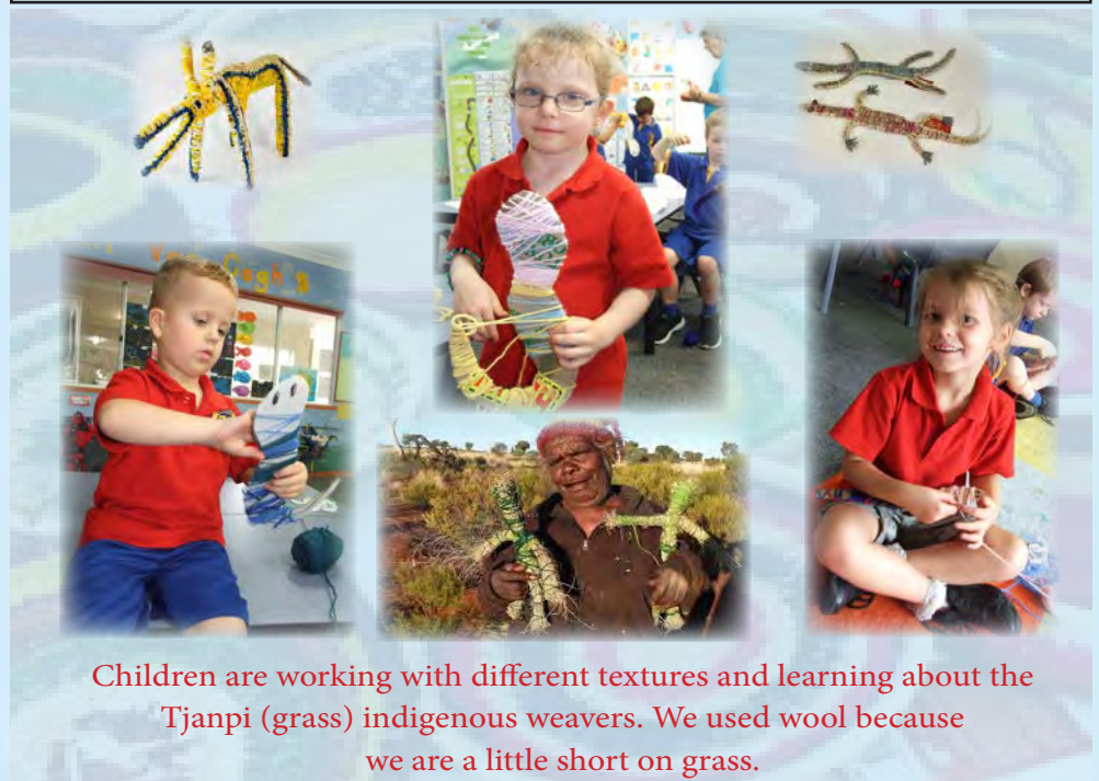
Children are working with different textures and learning about the Tjanpi (grass) indigenous weavers. We used wool because we are a little short on grass.